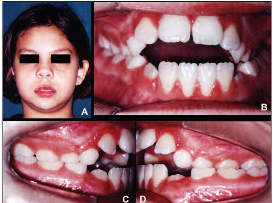
Figure 1. Photographs of the patient before treatment: (A) Frontal view of the patient with lips unsealed which is characteristic in mouth breathers; (B) Frontal view of the occlusion showing an open bite; (C) Lateral view of the occlusion on the right side; and, (D) lateral view of the occlusion on the left side showing a posterior crossbite.

Cephalometric measurements performed before and after treatment on the lateral x-ray are shown in Table 1. Before treatment, the mandible was properly positioned (SNB angle), and there were no significant alterations in the values for