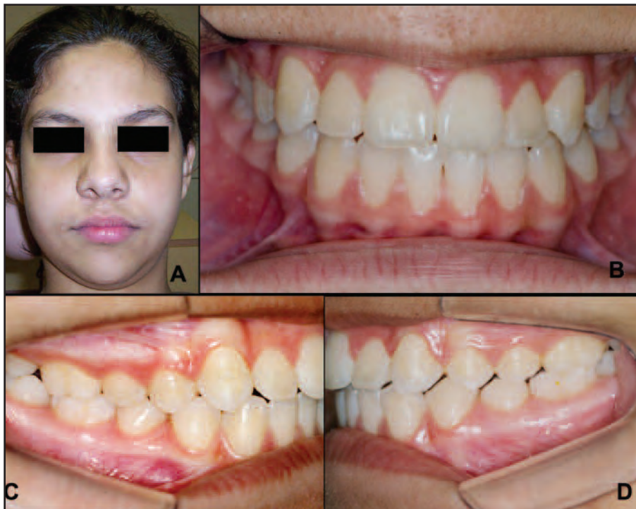
Figure 3. Photographs of the patient at the end of treatment with fixed orthodontics used for tooth alignment during phase II. (A) Frontal view of the patient maintaining lips seal and showing less muscular activity in the mental region comparing with figure 1A; (B) Frontal view of the occlusion at the end of treatment. A slight deviation of the midline in the lower dental arch remained at the end of treatment; (C) Lateral view of the occlusion on the right side with first molars and canines in Class I relationship at the end of treatment; (D) Lateral view of the occlusion on the left side with the crossbite corrected and Class I relationship at the first molars and canines.

The patient has been followed up during three years post-treatment and bilateral mastication has been encouraged. She wore the Trainer for Alignment (T4A, Myofunctional Research Co, Australia) as retainer during the first 12 months post-treatment, and then, it was discontinued and no retention was provided afterwards. Up today, there are no signs of relapse either of the open bite, crossbite or tooth alignment (Figure 5A-B). Mandibular excursions are properly performed (Figure 5C-D), which suggest muscular function has continued to improve and craniofacial growth and development has been reestablished to normal physiological patterns. A slight improvement in the lower midline is observed after three years of treatment (Figure 5A).