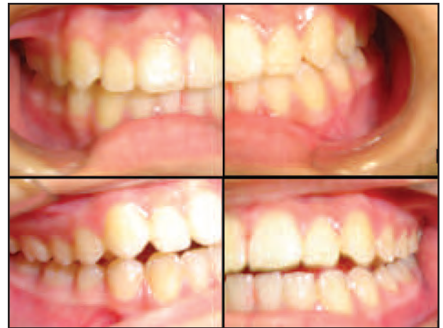
Figure 5. Occlusion of the patient on the right (A) and left (B) sides after three years of treatment. (C) (D) Mandibular excursions are smoothly performed toward both sides without interference. Patient wore a functional appliance as retainer for one year and no retention is maintained at this time.