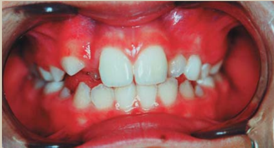
Figure 9 (above) 10 years old patient with a malocclusion Class I and ectopic eruption of the lateral incisors