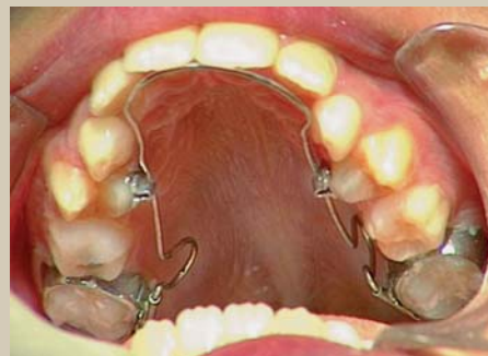
Figure 2 Picture showing the Farrell Bent Wire System placed in the upper arch