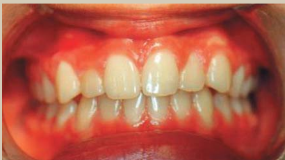
Figures 12 Pictures showing the case at the end of treatment

crowding and malocclusion and may cause relapse after treatment is finished. Thus, the Ortho-System may be proposed as an excellent alternative of treatment in those cases where arch development is required to align teeth, extractions wants to be avoided, patients want to minimize or even avoid brackets, mandible needs to be relocated, soft tissue dysfunction is present and treatment needs to be performed in reasonable time. DA