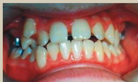
Figure 4 Diastemas are observed between the central incisors due to the arch development performed by the treatment. Note that the inclination of the incisors has not changed as the overjet has been maintained over the treatment