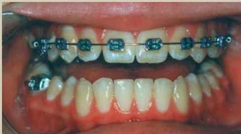
Figure 6 Lower teeth were aligned by the action of the Ortho-System without using brackets