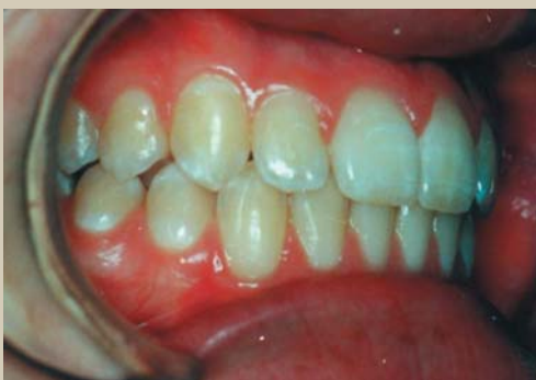
Figures 7 and 8 Pictures showing the case after 8 months of treatment

great arch development which permitted to align lower teeth without using fixed appliances (Figure 6). Thus, this case was treated in less than a year (Figures 7 and 8), achieving the goals of treatment, and most importantly, without extracting teeth due to arch development produced by the Ortho-System.