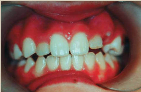
Figure 11 Arch development was achieved in the upper arch after 4 months of treatment with the Ortho-System